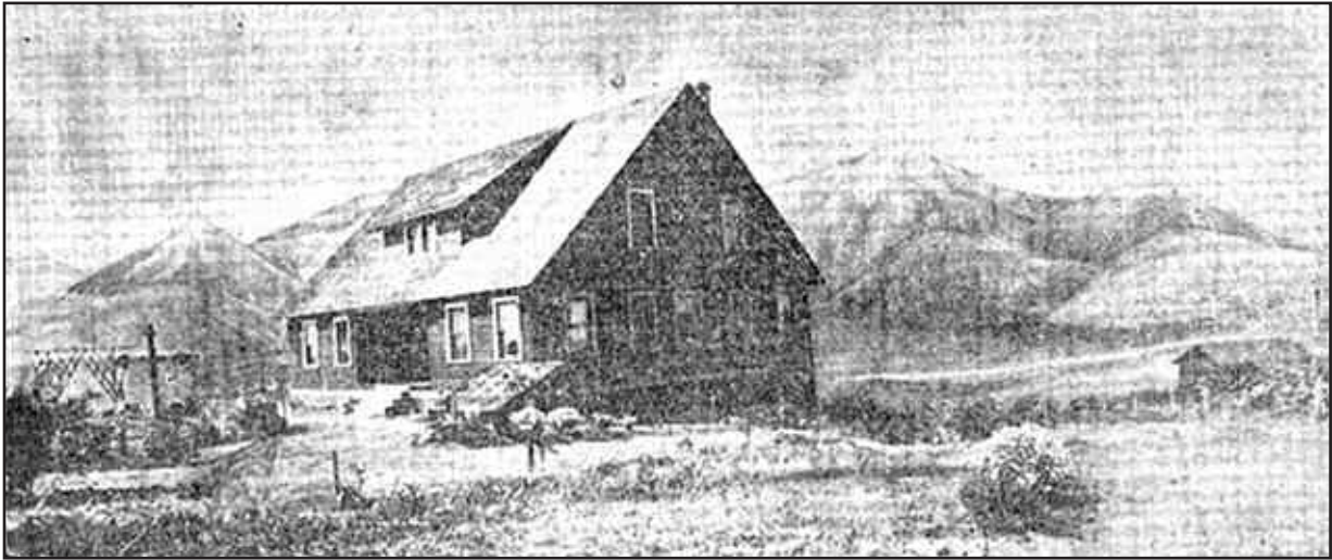
THE ADMINISTRATION BUILDING, SHOWING THE WONDERFUL VIEW OF THE MOUNTAINS.

In this building are housed, at the present time, the large General Offices, the Esoteric Secretary's Private Office, the extensive Printing Establishment, maintained by the Fellowship in which all their Printing is done, with the exception of the three bound books, and last, but not least, the large Mailing Department, through which the thousands of letters, magazines, books, etc., pass.